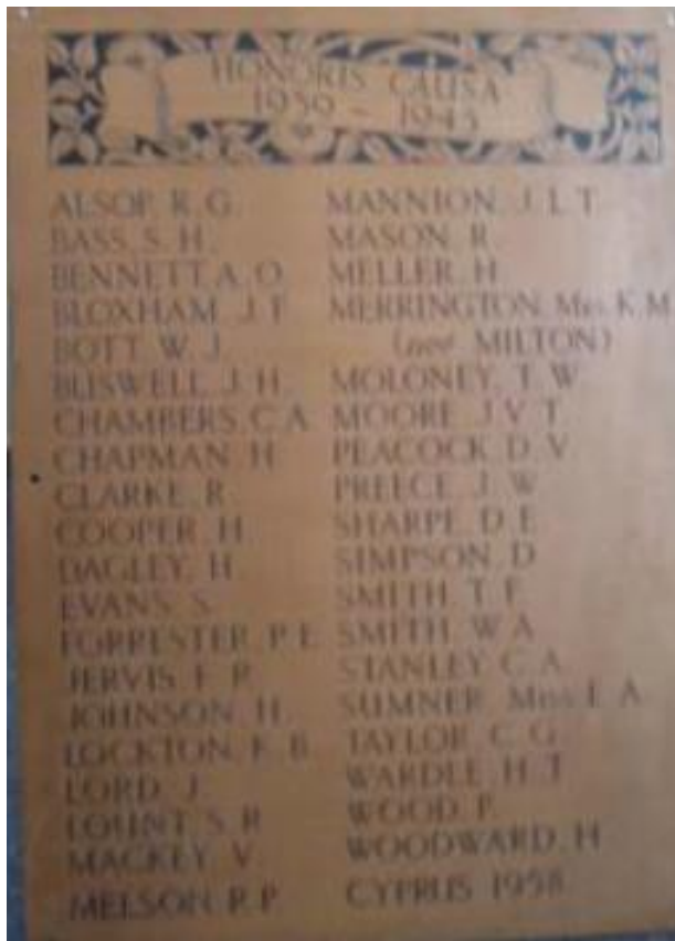
Hinckley Grammar School Memorial