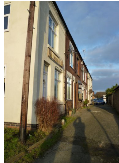
Figure 62 Balls Lane, Burbage (Britannia Road)

The village of Montbrehain was taken on the 3 rd October 1918, by three battalions of the Sherwood Foresters of the 46 th Division, but it could not be held at the time. It was finally captured by the 21 st and 24 th Australian Infantry Battalions two days later. The Calvaire Cemetery contains the graves of 71 casualties of the First World War, including Private Bob Bates.