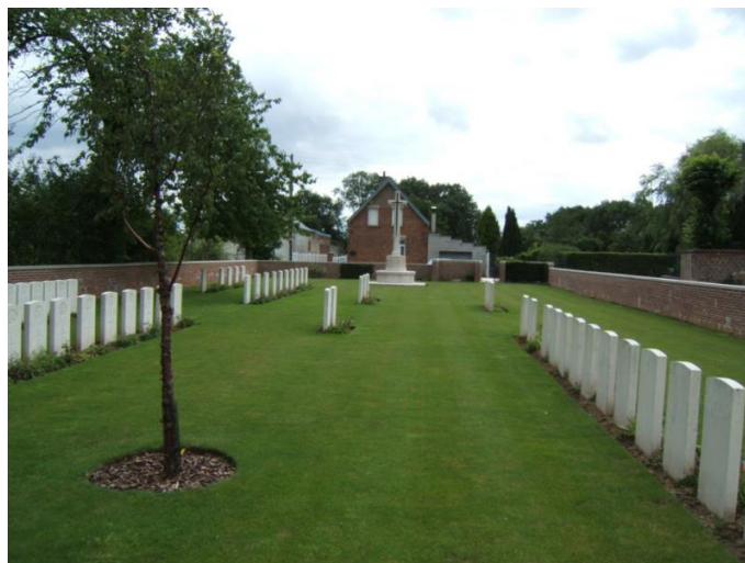
Figure 63 Cemetery, Montbrehain