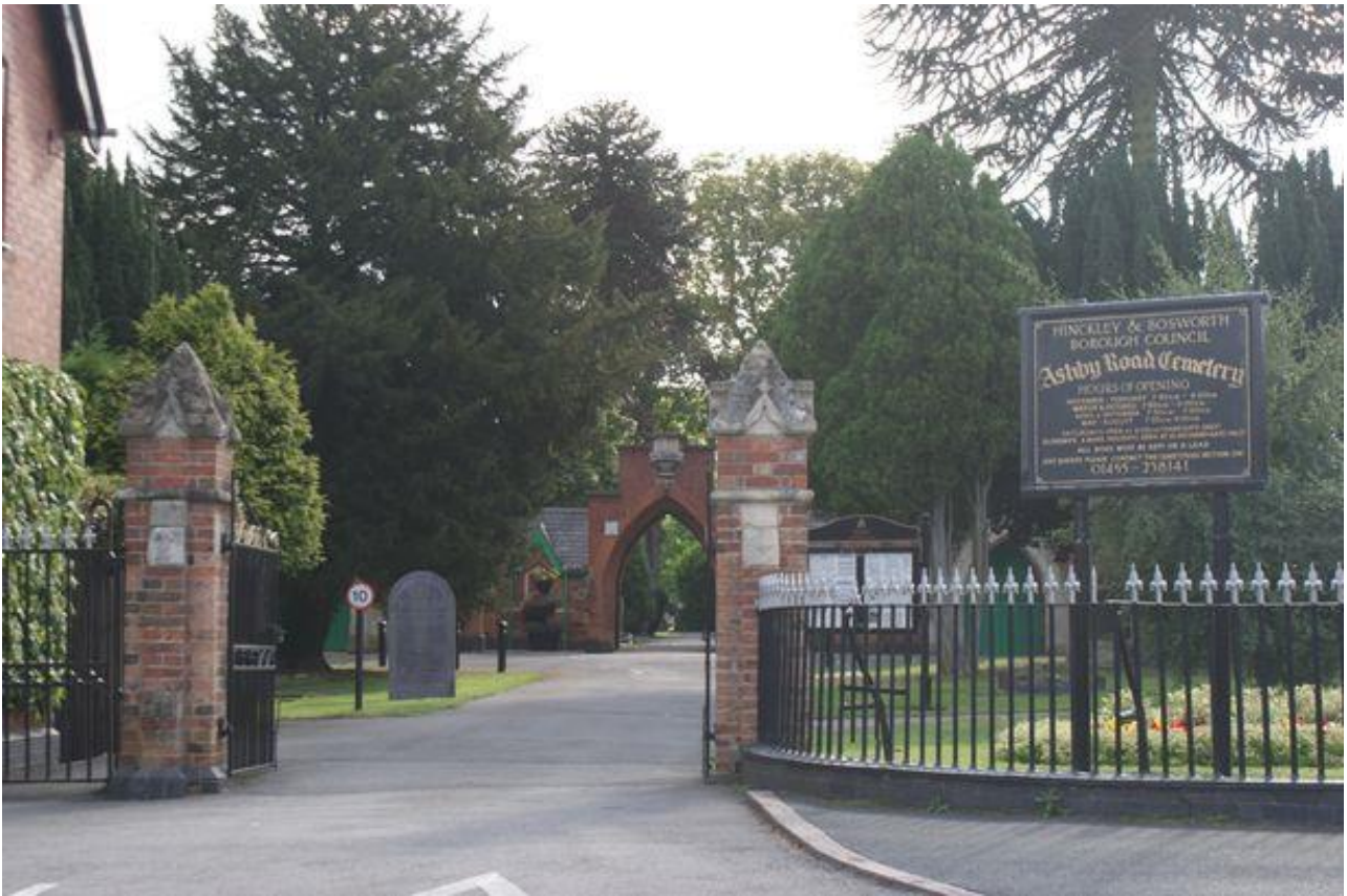
Hinckley Cemetery, Ashby Road, Hinckley