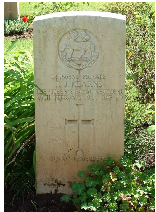
Beachy Head War Cemetery, Anzio