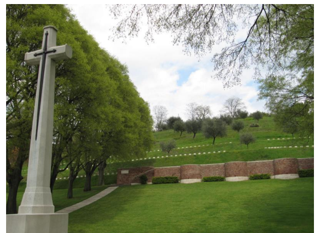
Gradara War Cemetery, Pesaro, Italy