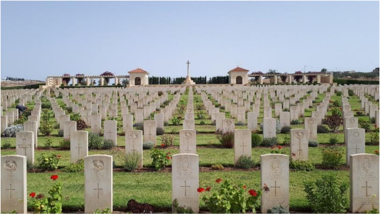
Massicault War Cemetery, Tunis, Tunisia