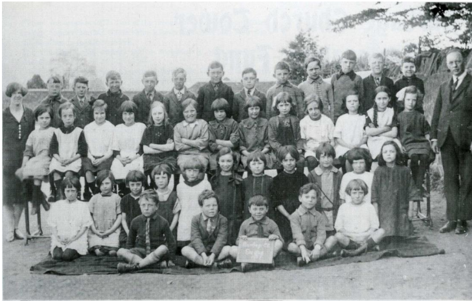
One of many school photographs which seemed to have been taken quite frequently in the 1920's. This particular one, chosen from many, was taken at the Church of England School in 1927, and shows (left to right)—