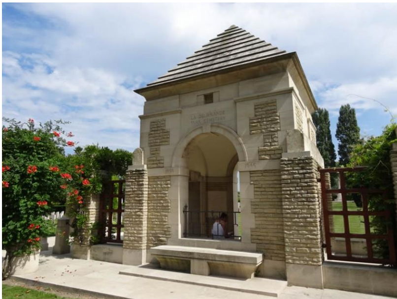
La Delivrande War Cemetery, Calvados, France

The allied offensive in north-western Europe began with the Normandy landings of 6 June 1944. The burials in La Delivrande War Cemetery mainly date from 6 June and the landings on Sword beach, particularly Oboe and Peter sectors. Others were brought in later from the battlefields between the coast and Caen. There are 942 Commonwealth servicemen of the Second World War buried or commemorated in this cemetery. The cemetery also contains 193 German graves.