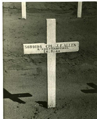
Beach Head War Cemetery, Anzio, Italy