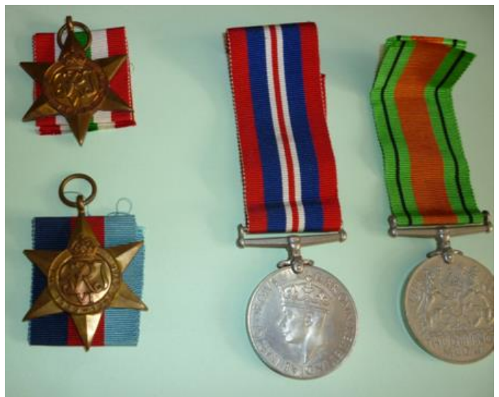
Citations & Medals