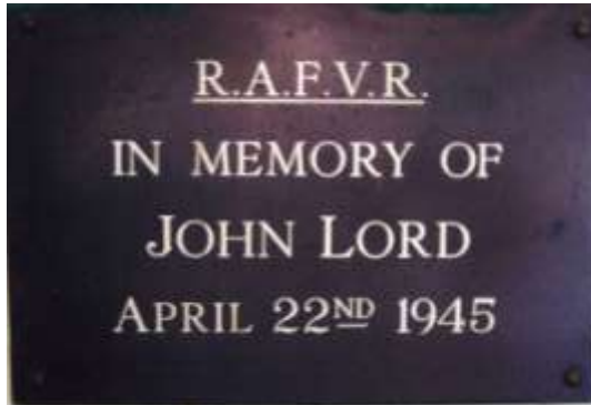
Sr Catherine's Church