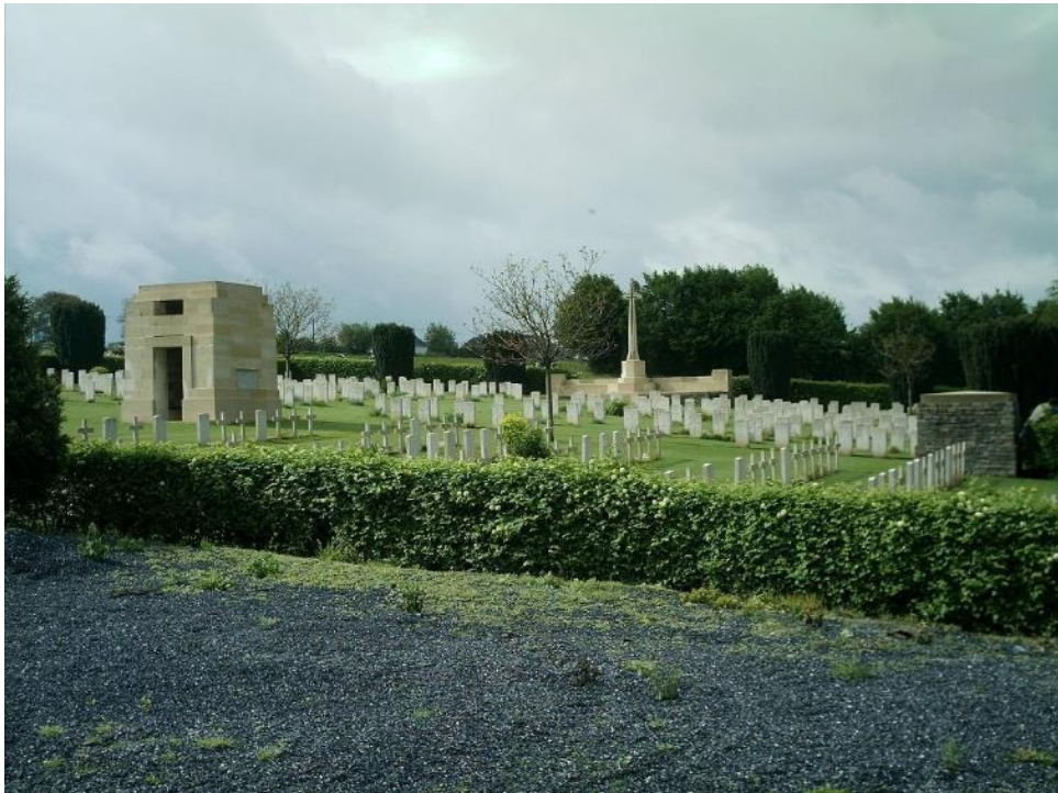
Glageon Communal Cemetery Extension, Nord, France

His register of effects states he was a prisoner of War in Germany. However, he is buried in the Glageon Extension cemetery which was held exclusively by the Germans until the end of the war. The Cemetery has German as well as 300 British and allied graves of which all but ten were POW.