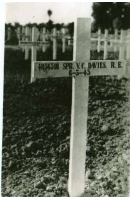
Sfax War Cemetery Tunisia

On 9 th January 1942, he left his wife and two young sons for the last time arriving in Suez on 30 th March 1942 to join the war in North Africa.