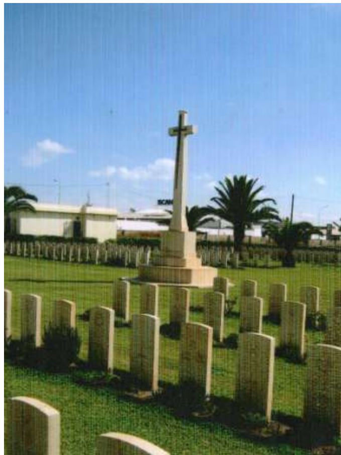
Sfax War Cemetery, Tunisia