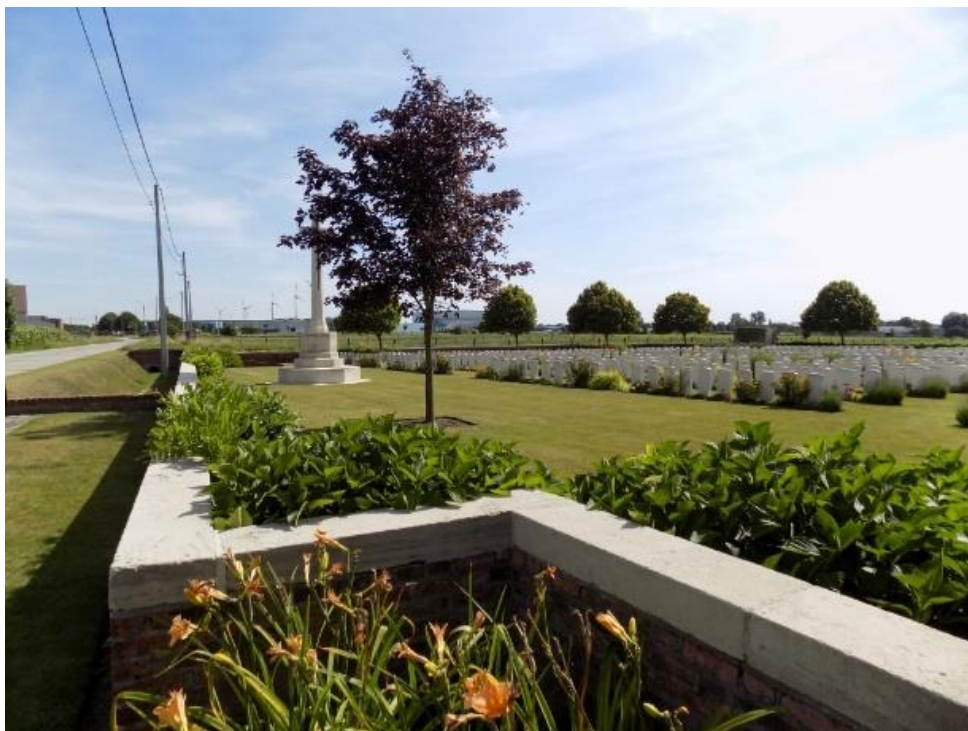
Artillery Wood Cemetery, Boesinghe, Belgium