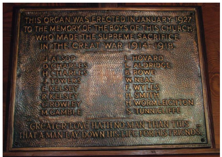
Congregational Church Memorial