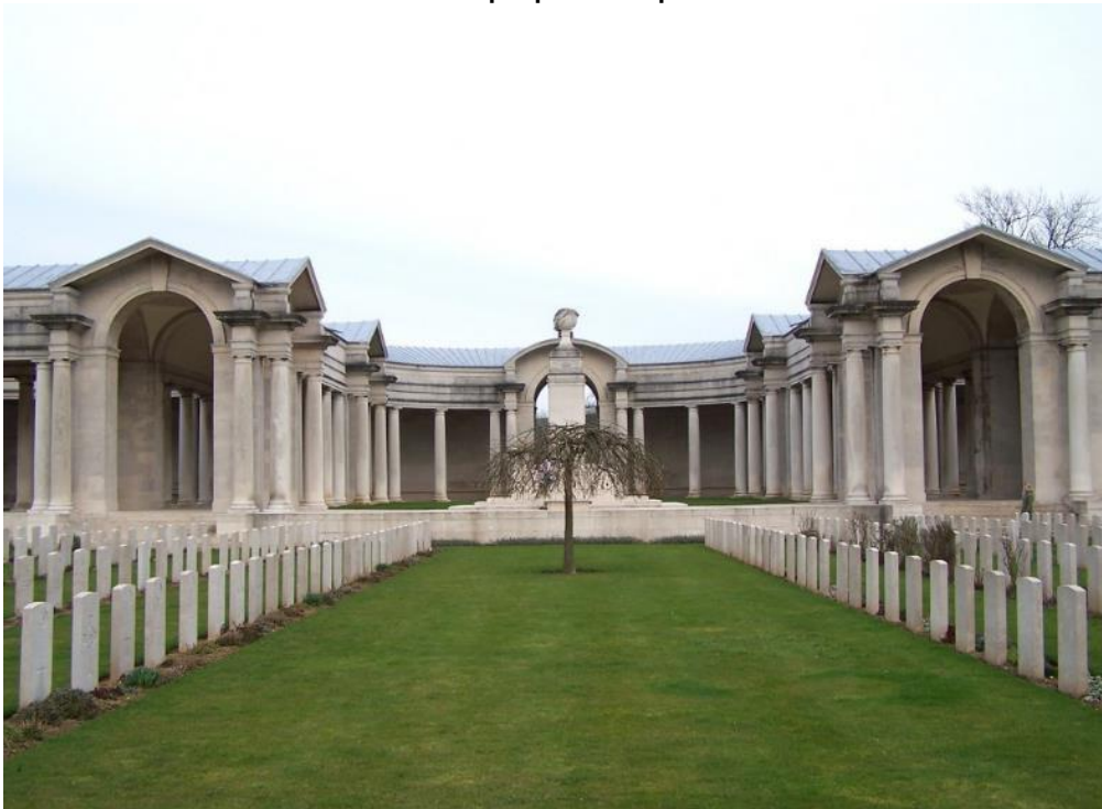
Arras Memorial, Pas de Calais, France