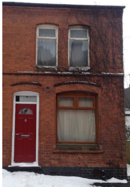
5 Strutt Road