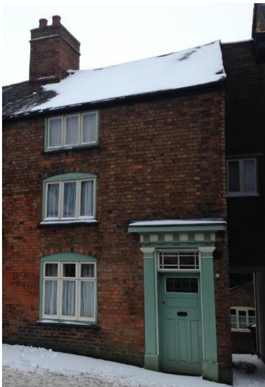
77 Church Street