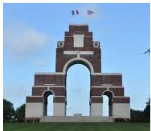
Thiepval Memorial, Somme, France

Sometime during WW1 the family moved to Balls Lane and settled in Burbage.