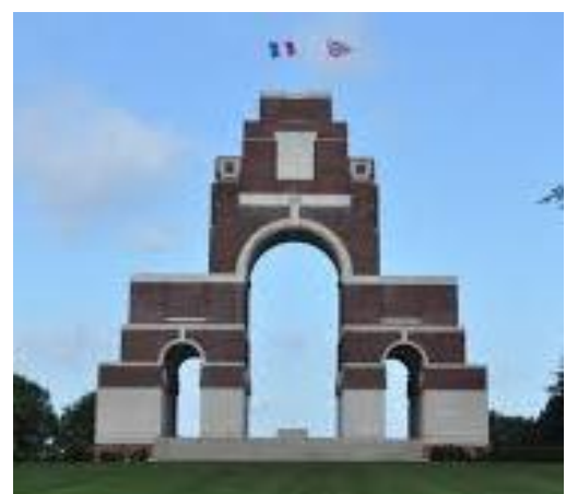
Thiepval Memorial, Somme, France

Sometime during WW1 the family moved to Balls Lane and settled in Burbage.