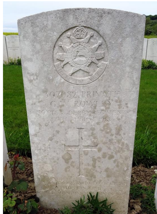
Pernes British Cemetery, Pas de Calais, France