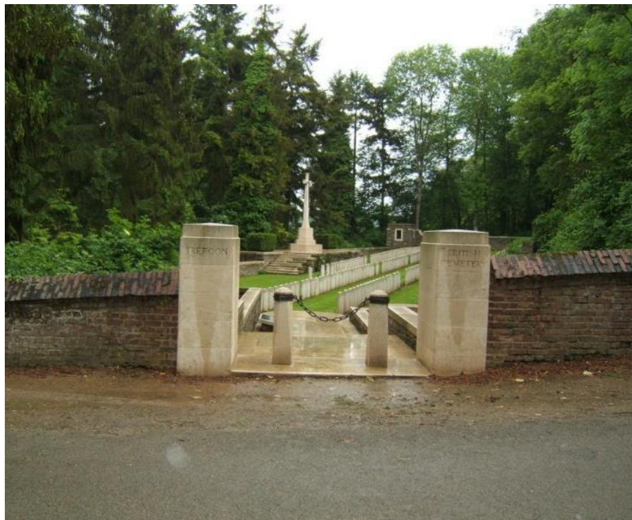
Trefcon British Cemetery, Caulaincourt, France