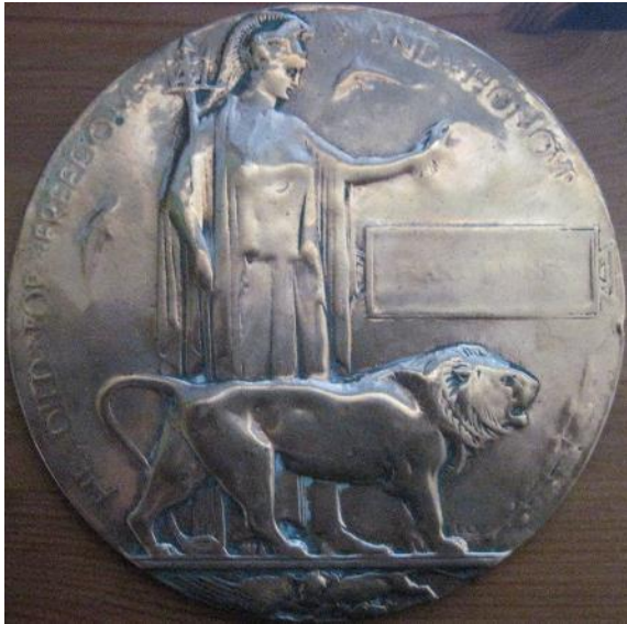
WW1 Death Plaque