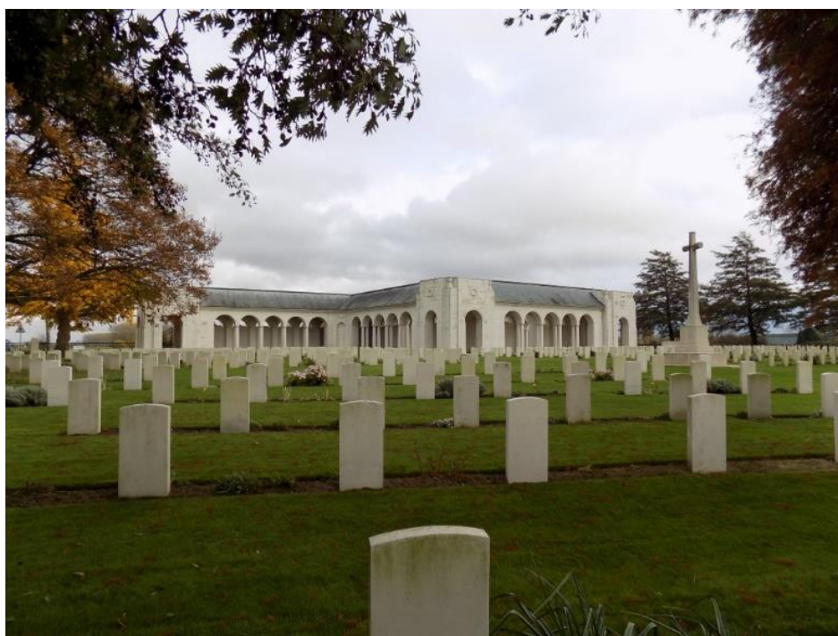
Le Touret Cemetery, Pas de Calais, France