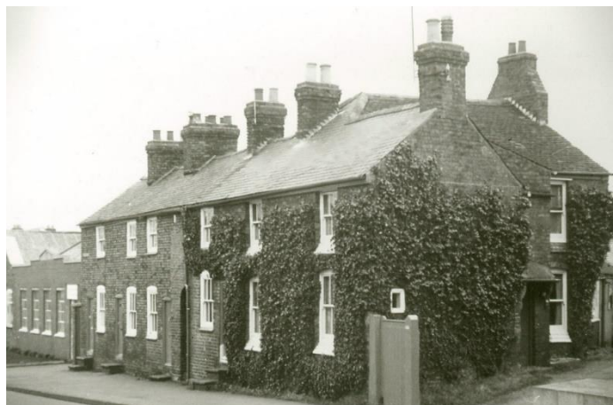
82 Hinckley Road, Burbage