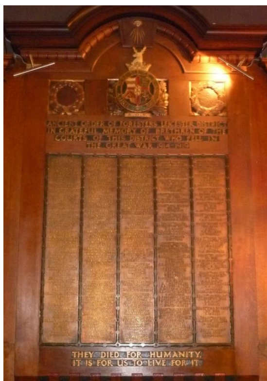
Order of Foresters Memorial