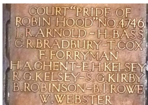
Order of Foresters Memorial