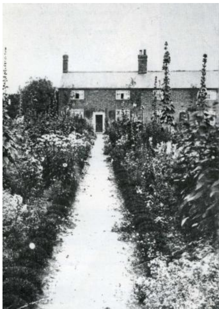
Ghent's Cottage, Coventry Road