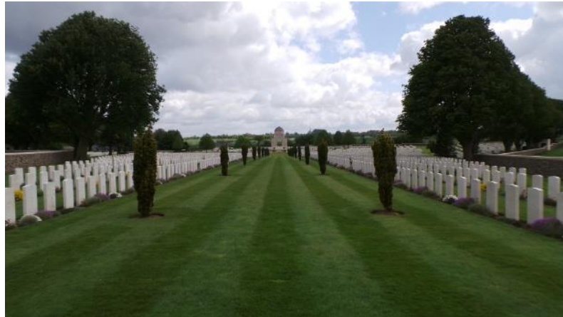
Cabaret-Rouge Cemetery, Souchez, France