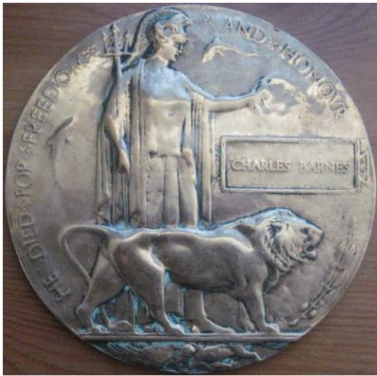
WW1 Death Plaque