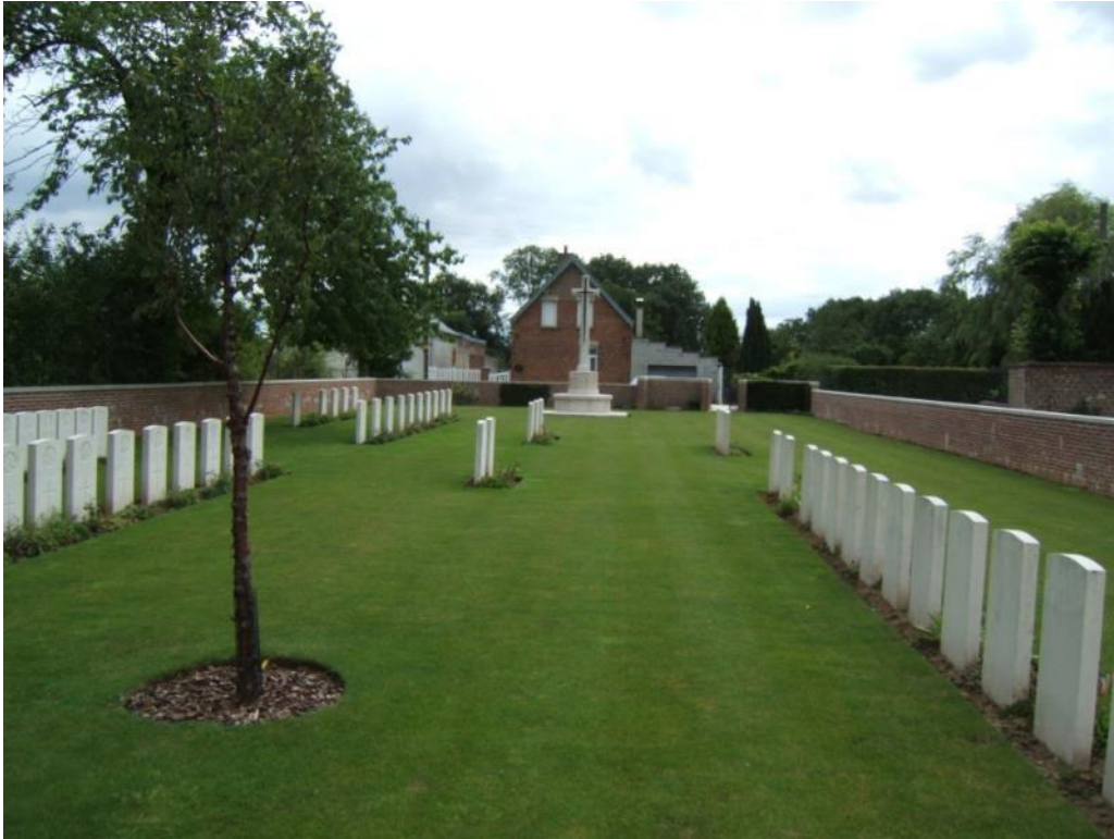
Calvaire Cemetery, Montbrehain