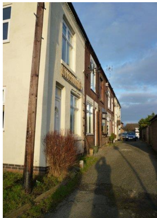
Balls Lane, Burbage (Britannia Road)