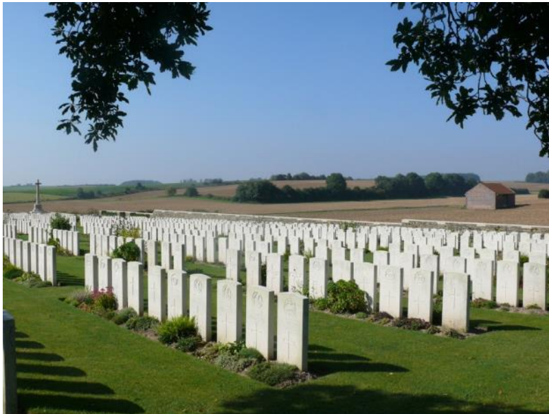
Bellicourt British Cemetery, Aisne, France