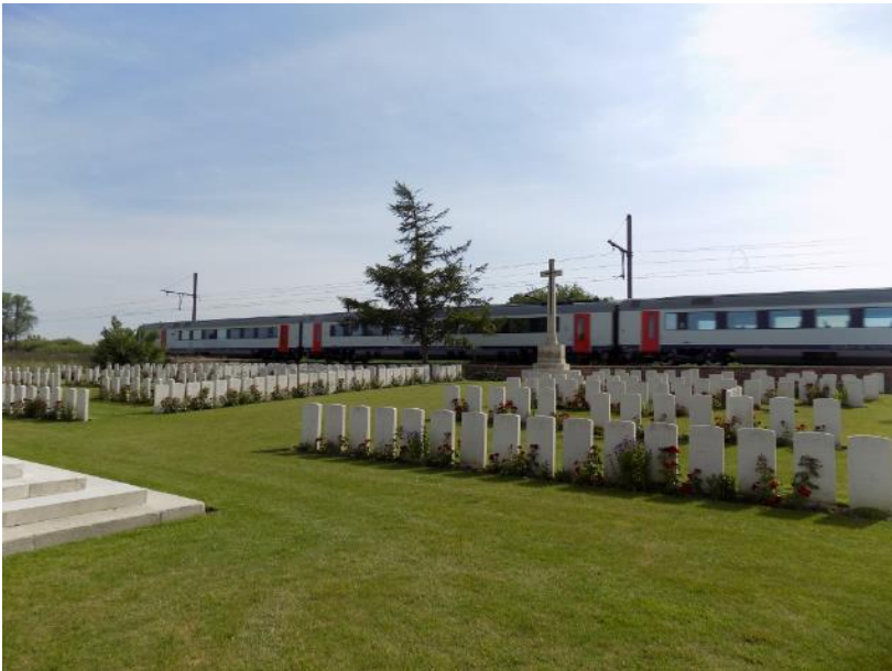
Larch Wood (Railway Cutting) Cemetery