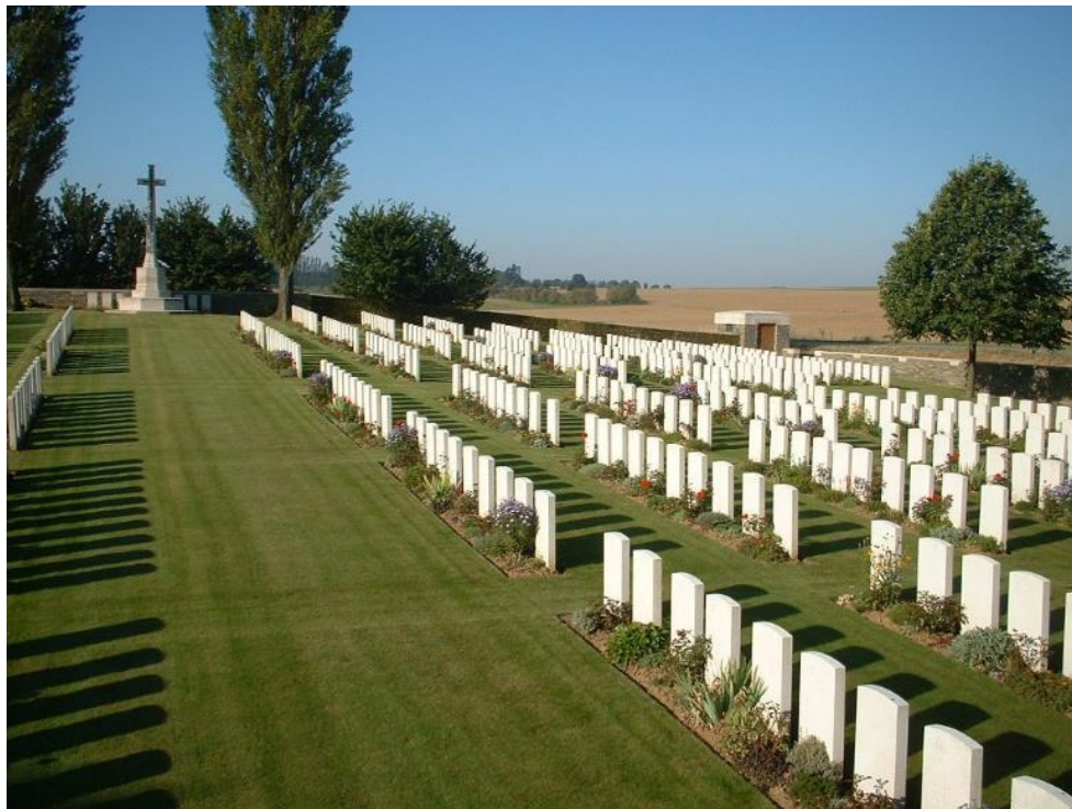
Unicorn Cemetery, Vendhuile, France