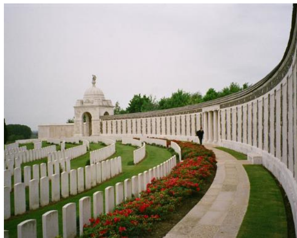
Tyne Cot Memorial