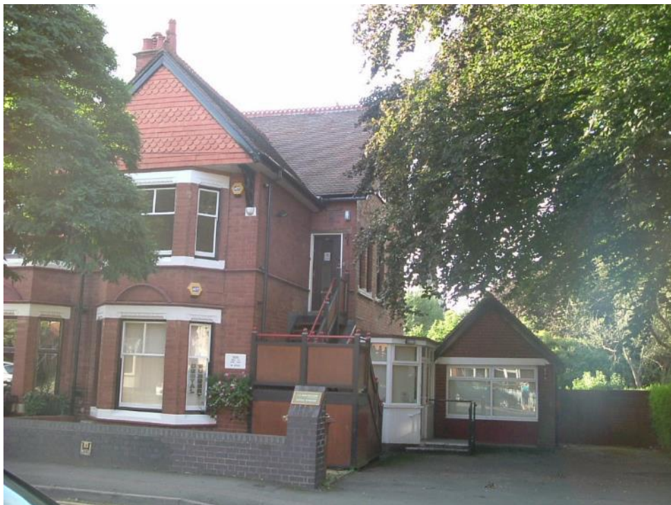
23 Mount Road